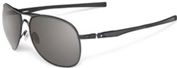
Matte Black/Warm Grey