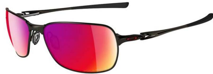
Pewter / OO Red Polarized OO4046-03