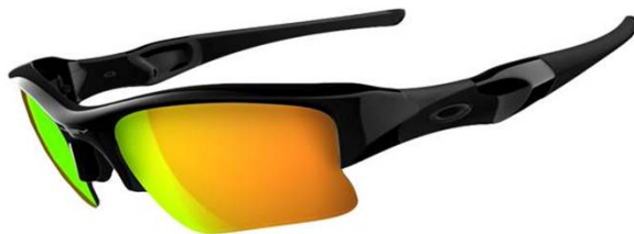
Polished Black / Fire Iridium 03-899