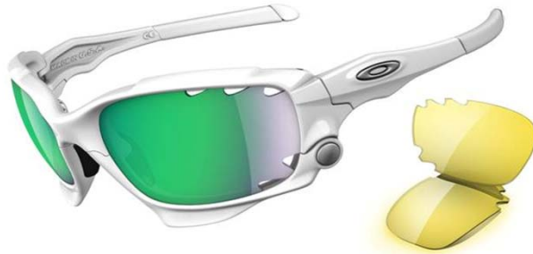
Polished White/Jade Iridium Vented + Yellow 26-210