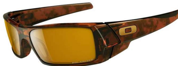
Tortoise/ Bronze Polarized 12-855