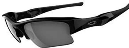
Jet Black / Black Iridium 03-915