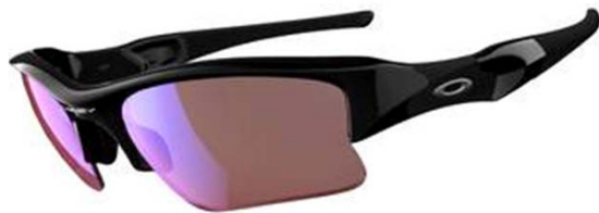
Jet Black / G30 03-921