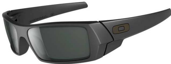
Matte Black / Grey 03-473