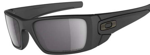
Matte Black / Grey Polarized OO9096-05 Cost: $158.50(c)