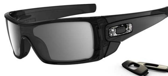
Polished Black / Black Iridium OO9101-01 Cost $133.50(c)