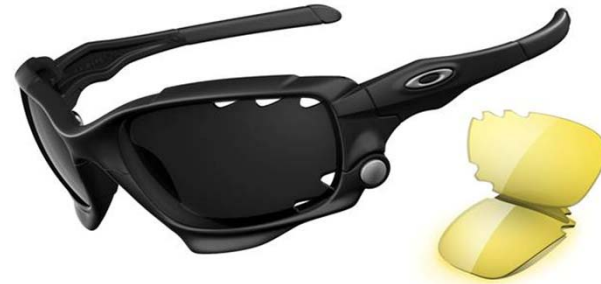
Matte Black/Black Iridium Vented + Yellow 04-207