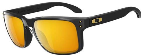
Polished Black / 24K Iridium