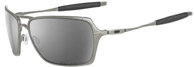
Light / Black Iridium Polarized 05-634