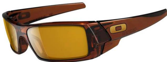
Polished Rootbeer / Bronze 03-472