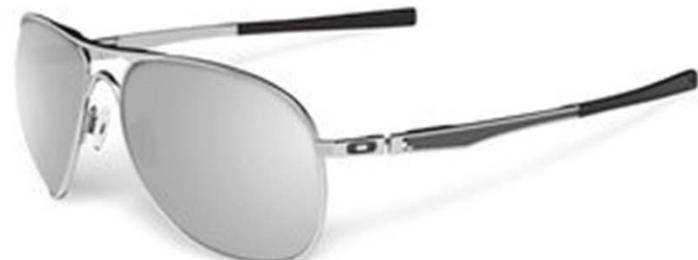
Polished Chrome/Chrome Iridium