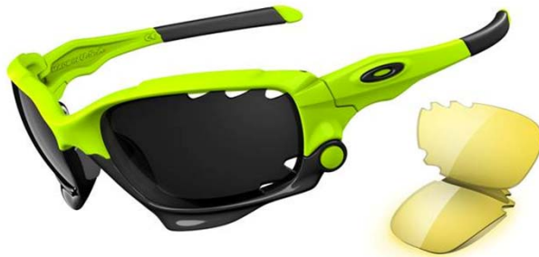
Retina Burn/Black Iridium Vented + Yellow 04-205