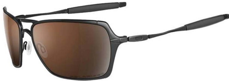
Polished Black / VR28 Black Iridium Polarized 24-117