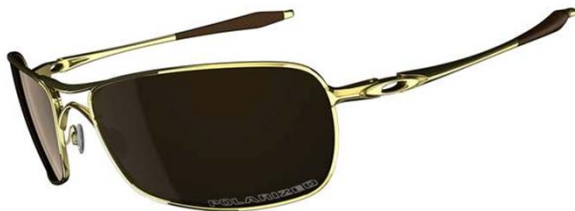
Polished Gold / Bronze Polarized OO4044-02