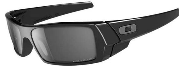
Polished Black / Grey Polarized 12-891