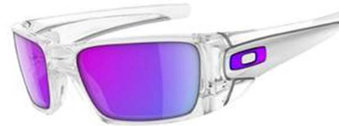
Polished Clear Matte Clear / Violet Iridium OO9096-04 Cost: $117.00(c)