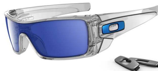
Clear / Ice Iridium OO9101-07 Cost $133.50(c)