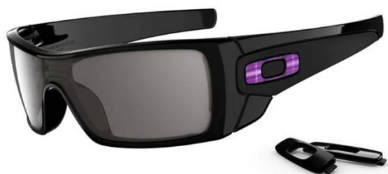
Polished Black / Warm Grey OO9101-08 Cost $120.85(c)