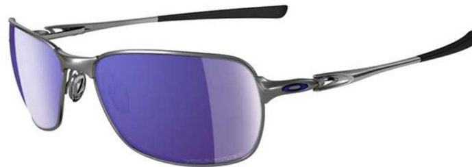
Lead / Ice Iridium Polarized OO4046-02