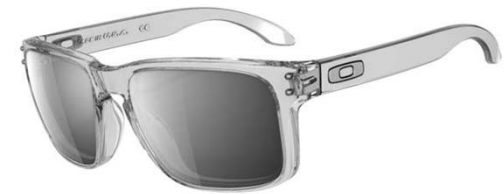
Polished Clear / Chrome Iridium