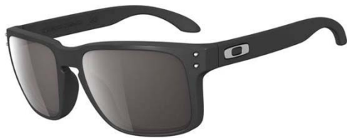
Matte Black / Warm Grey