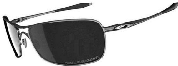
Lead / Black Iridium Polarized OO4044-03