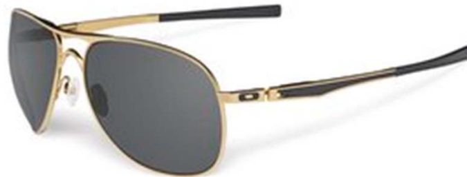
Polished Gold w/ Dark Grey