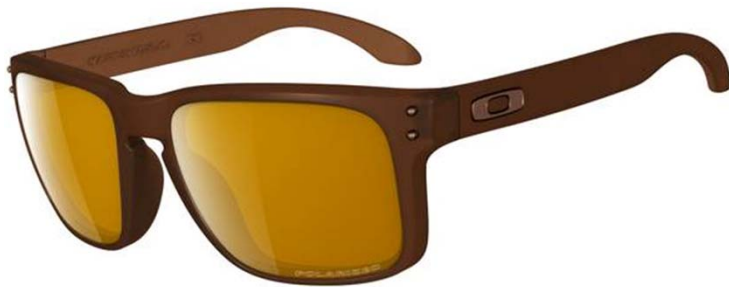
Matte Rootbeer / Bronze Polarized OO9102-03