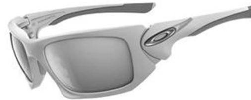
Matte White / Black Iridium OO9095-03 Cost $133.50(c)