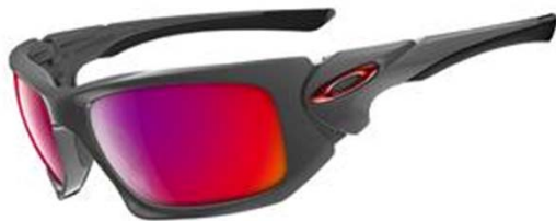
Dark Grey / Positive Red Iridium OO9095-04 Cost $133.50(c)