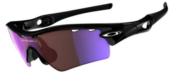
Jet Black / G30 09-686 Cost $191.75 (c)