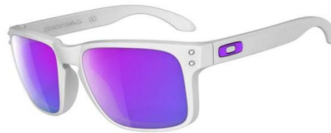
Matte White / Violet Iridium