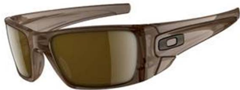
Polished Brown Smoke / Dark Bronze OO9096-02 Cost: $105.00(c)