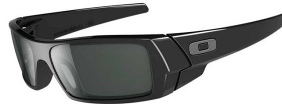
Polished Black / Grey 03-471