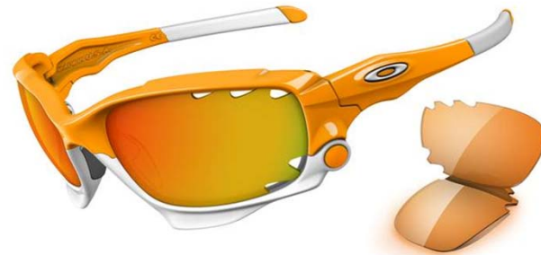
Atomic Orange/Fire Iridium Vented + Persimmon 04-206