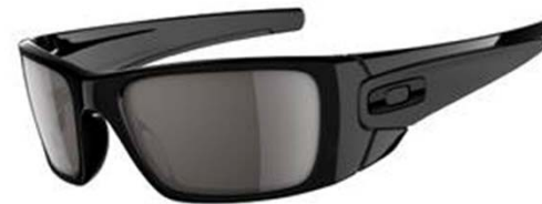
Polished Black/Matte Black / Warm Grey OO9096-01 Cost: $105.00(c)