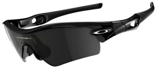
Polished Black / Grey 09-670 Cost $160.00 (c)