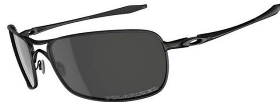
Matte Black / Grey Polarized OO4044-01