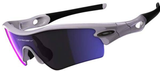
White Chrome / Blue Iridium 09-673 Cost $191.75 (c)