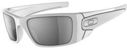
Polished White Matte White / Black Iridium OO9096-03 Cost: $117.00(c)