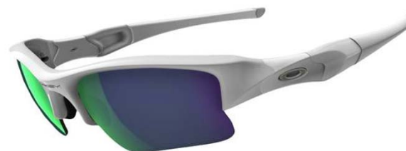
Matte White White / Jade Iridium 26-222