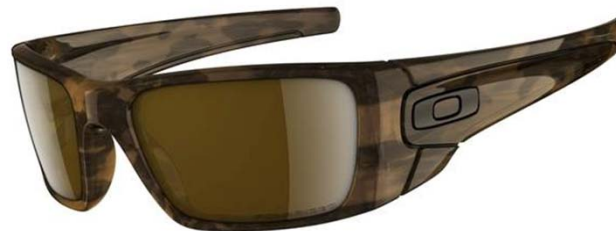
Brown Tortoise / Bronze OO9096-06 Cost: $158.50(c)