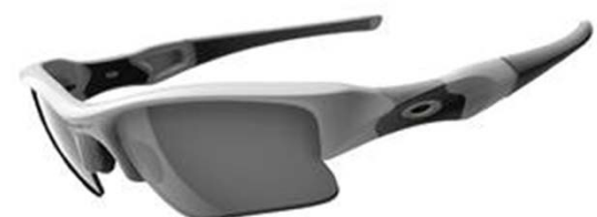
Polished White / Black Iridium 03-917