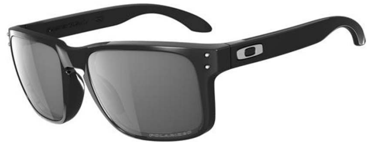
Polished Black / Grey Polarized OO9102-02