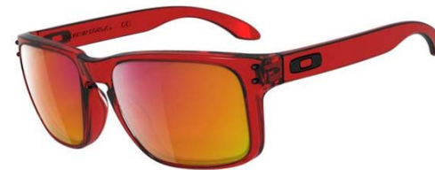
Crystal Red / Ruby Iridium