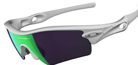
Matte White White / Jade Iridium 26-214 Cost $191.75 (c)