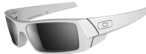
Polished White / Black Iridium 03-474