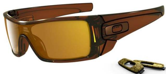
Polished Rootbeer / Dark Bronze OO9101-02 Cost $120.85(c)