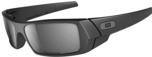
Matte Black / Black Iridium Polarized 12-856