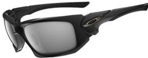
Polished Black / Black Iridium OO9095-01 Cost $133.50(c)