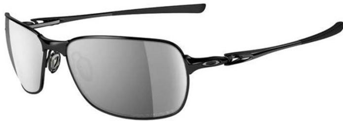
Polished Black / Black Iridium Polarized OO4046-01