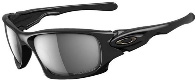
Polished Black / Black iridium Polarized OO9128-05