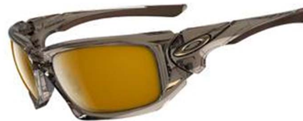
Brown Smoke / Dark Bronze OO9095-02 Cost $120.83(c)