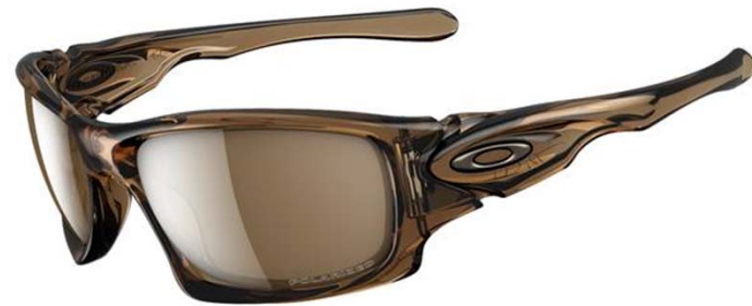
Brown Smoke / Tungsten Iridium Polarized OO9128-04