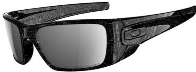
Black Grey History Text / Black Iridium Polarized OO9096-07 Cost: $170.85(c)