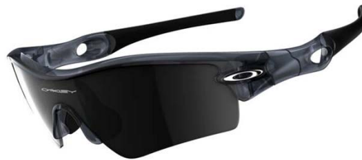
Crystal Black / Black Iridium 09-671 Cost $191.75 (c)